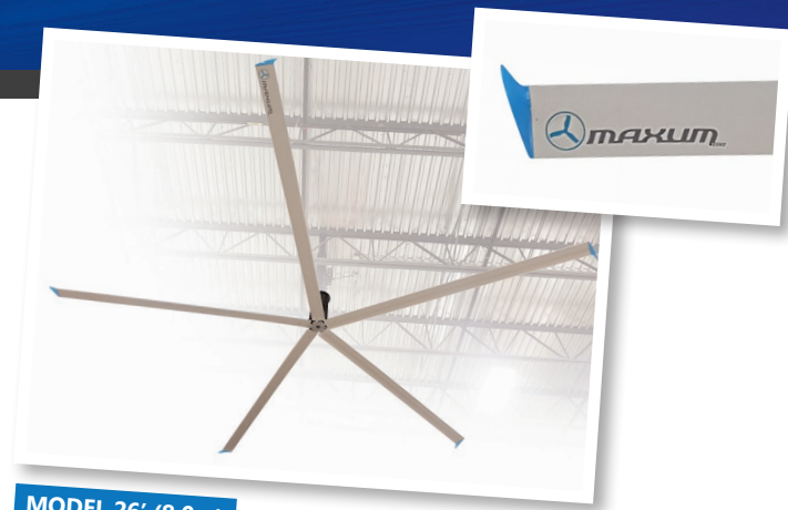
MODEL 26' (8,0m)